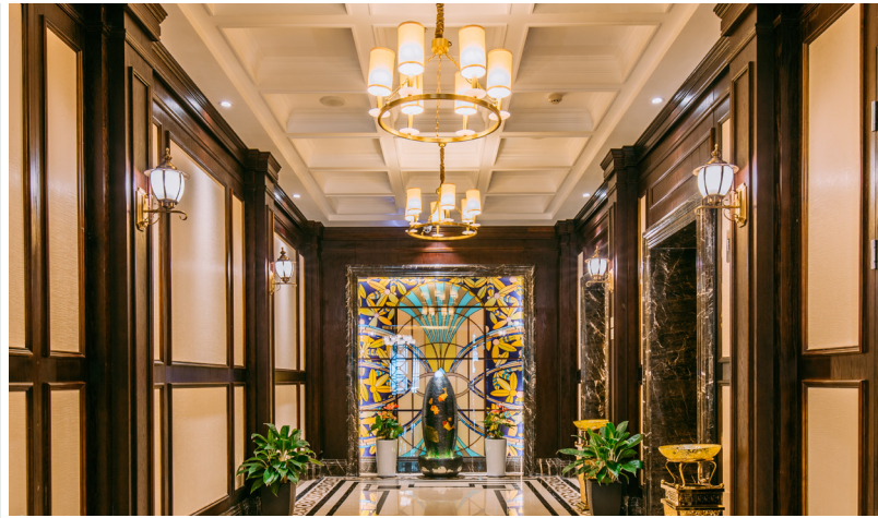
LED Performer1 Candle