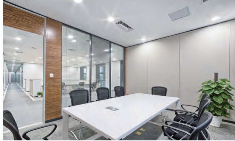
LED US Pro Tunable Downlight