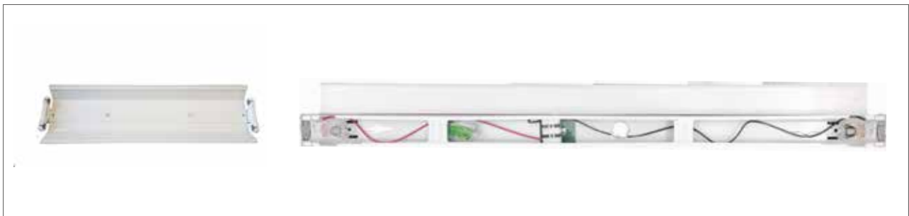
LED Utility T8 Empty Batten (Match with single-end T8 Tube)