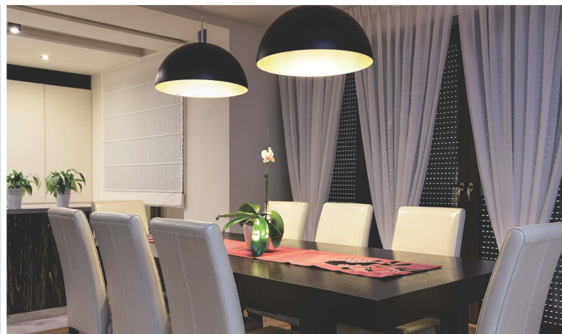
LED Performer Tunable White Bulb