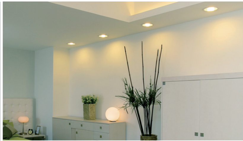
LED Downlight HM